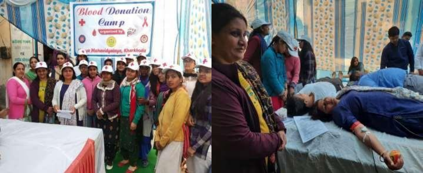
Blood Donation camp at Kharkhoda market on 26 th January, 2020