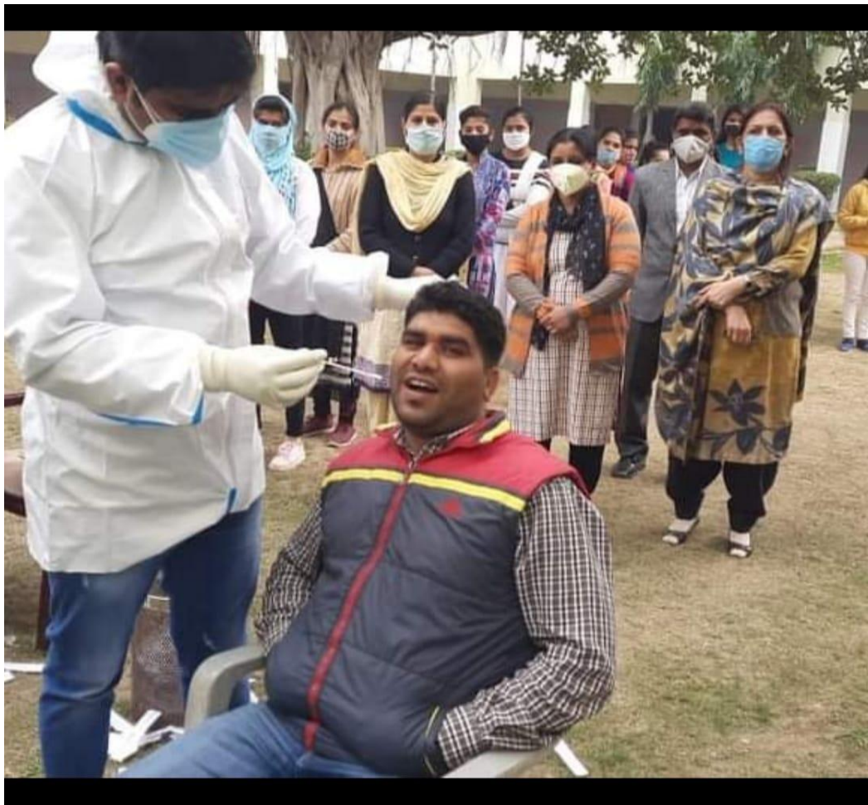
Corona Test was conducted in collaboration with General Hospital, Kharkhoda