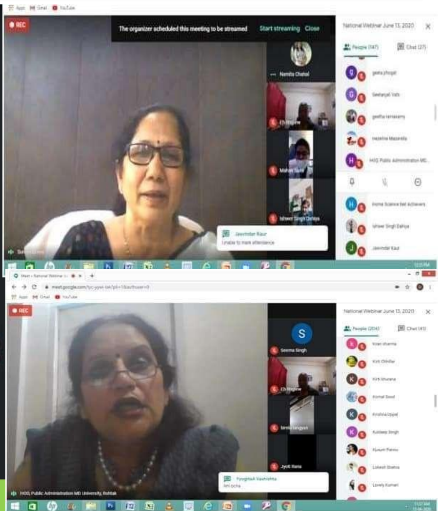
National Webinar on 13-06-2020