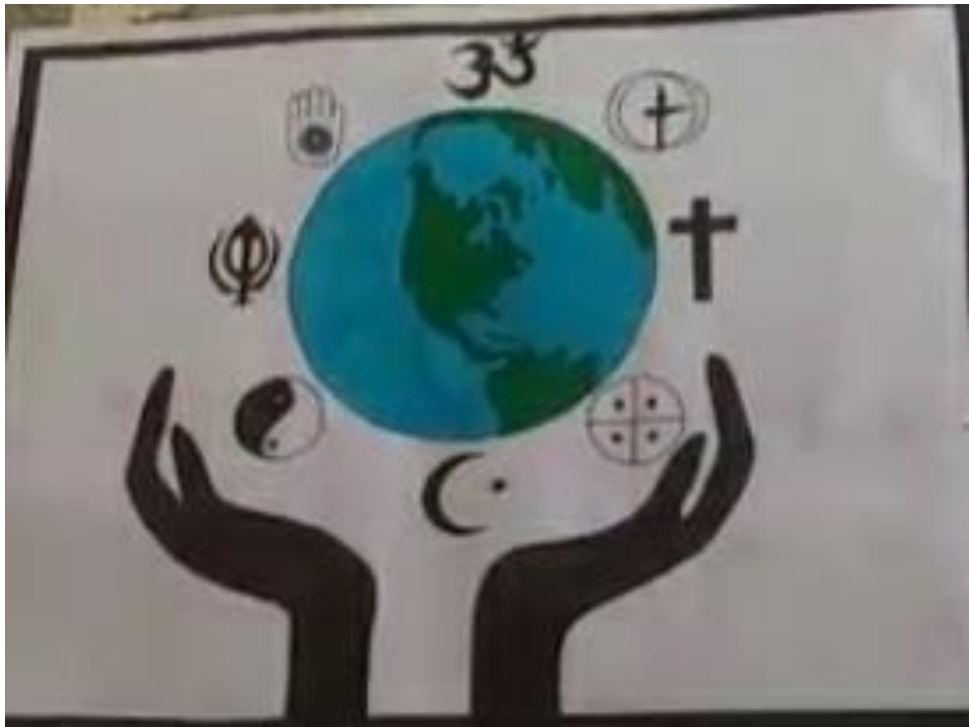
To make bond with family and Nature