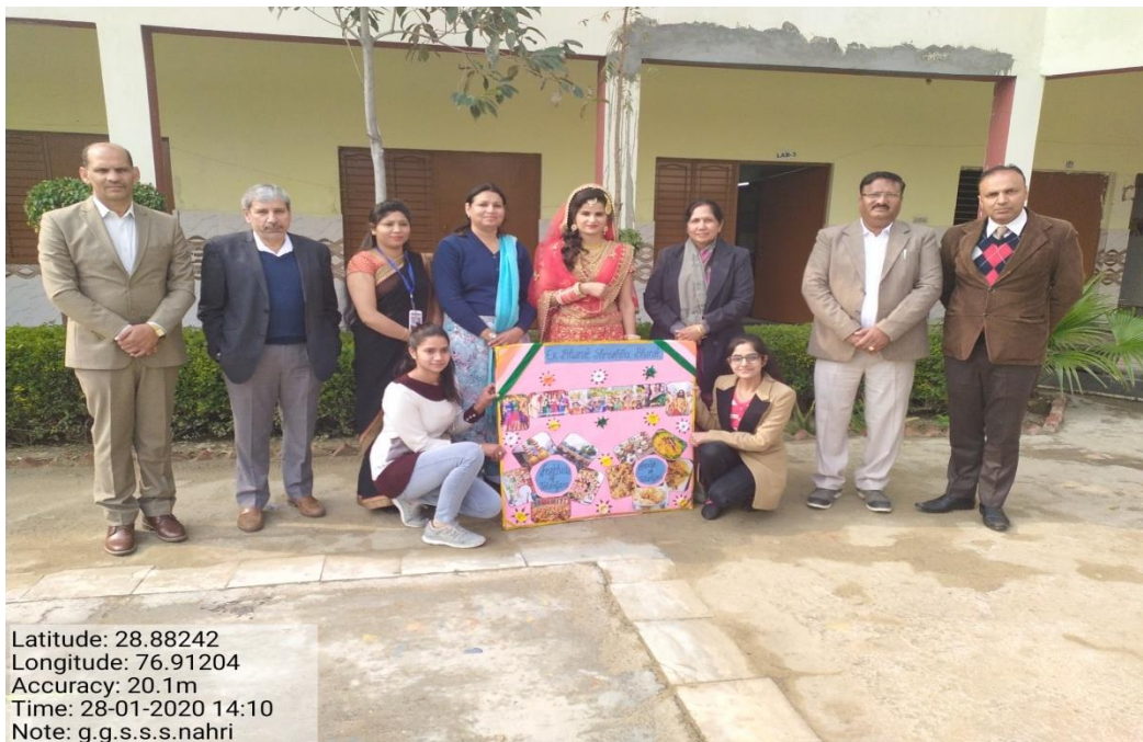
Bridal Dress wearing