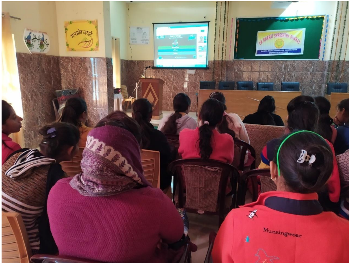
Workshop on Telegue Language