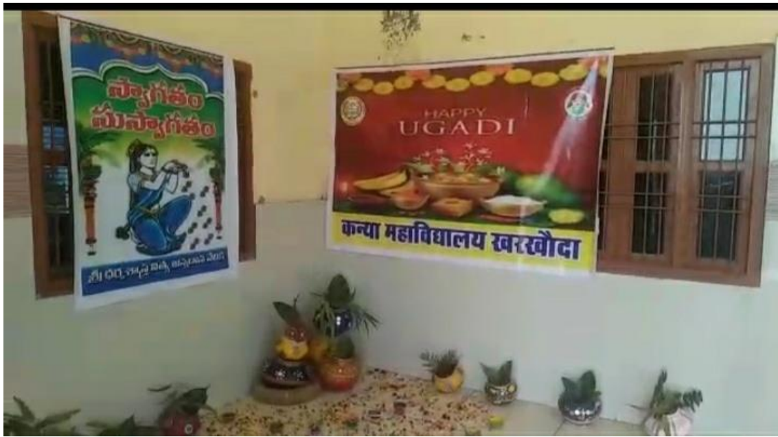
Ogadi Festival & Cultural Celebration